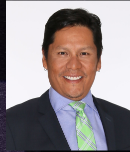
Notah Begay, III