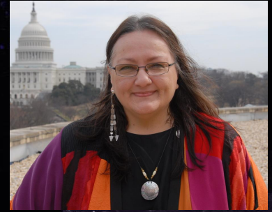
Suzan Shown Harjo