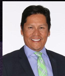
Notah Begay, III