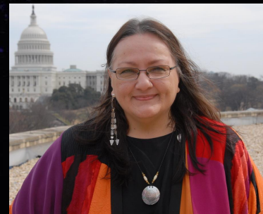
Suzan Shown Harjo